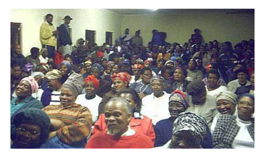
One of the twice weekly Anti-eviction Campaign meetings in Mandela Park