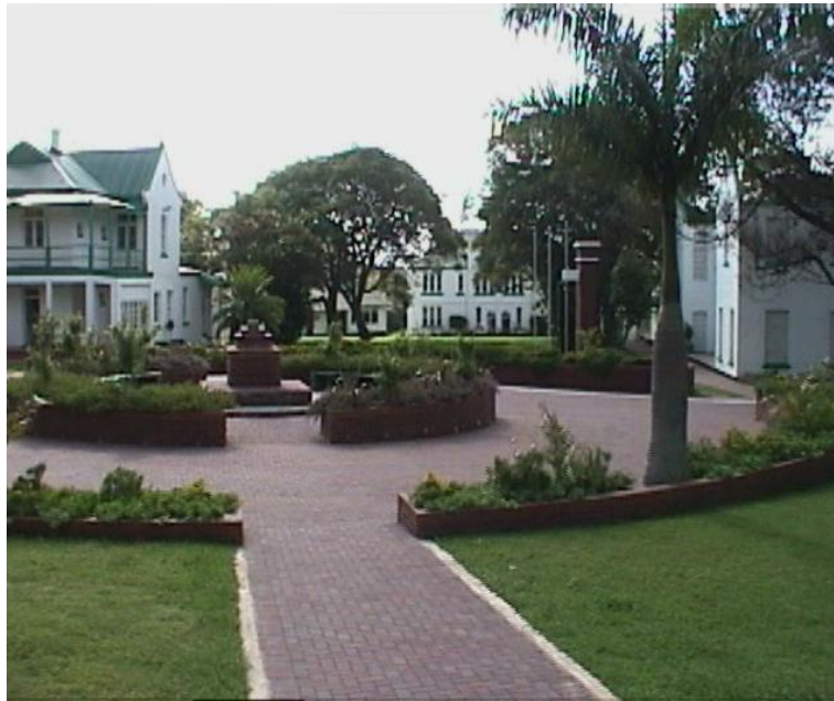
Inanda Seminary Campus

and predominately rural Congregational mission in Natal had a comparatively weak denominational polity with which to absorb the title wave that was the government's take-over of ecclesiastic schools. Just as the founding of Inanda Seminary "was nothing short of revolutionary", its survival is nothing short of miraculous. 5 Throughout the succeeding decades until the new century, the school repeatedly found itself on the verge of closure. The following narrative chronicles the beginning of many potential ends of the school due to the National Party government's implementation of Bantu Education.